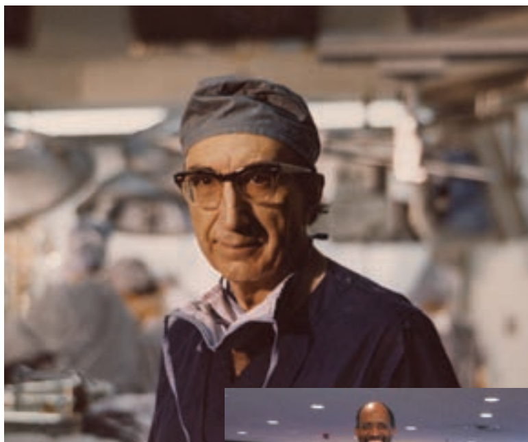
▲ Dr. DeBakey (in NLM's Profiles in Science video)